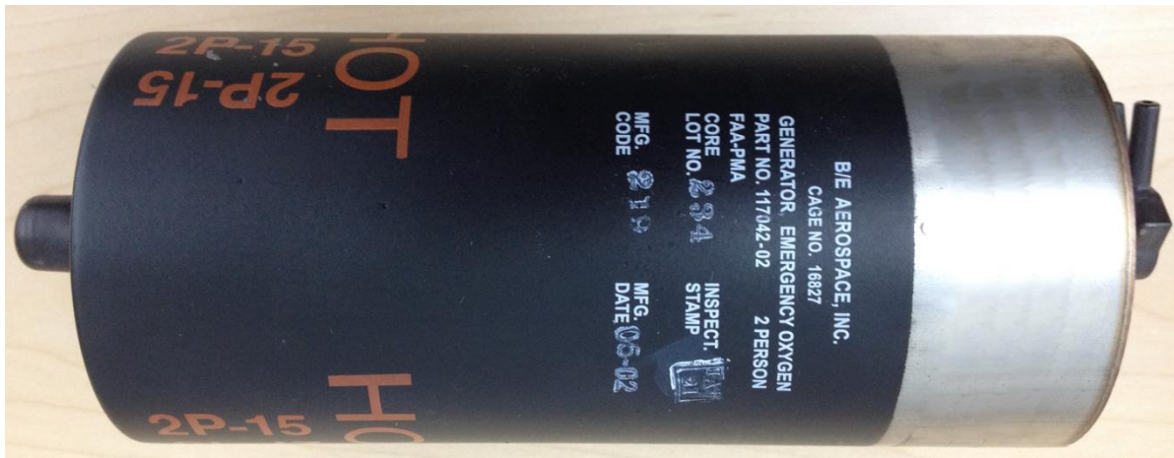
Figure 2 – MFG.DATE (05-02 = May 2002) example