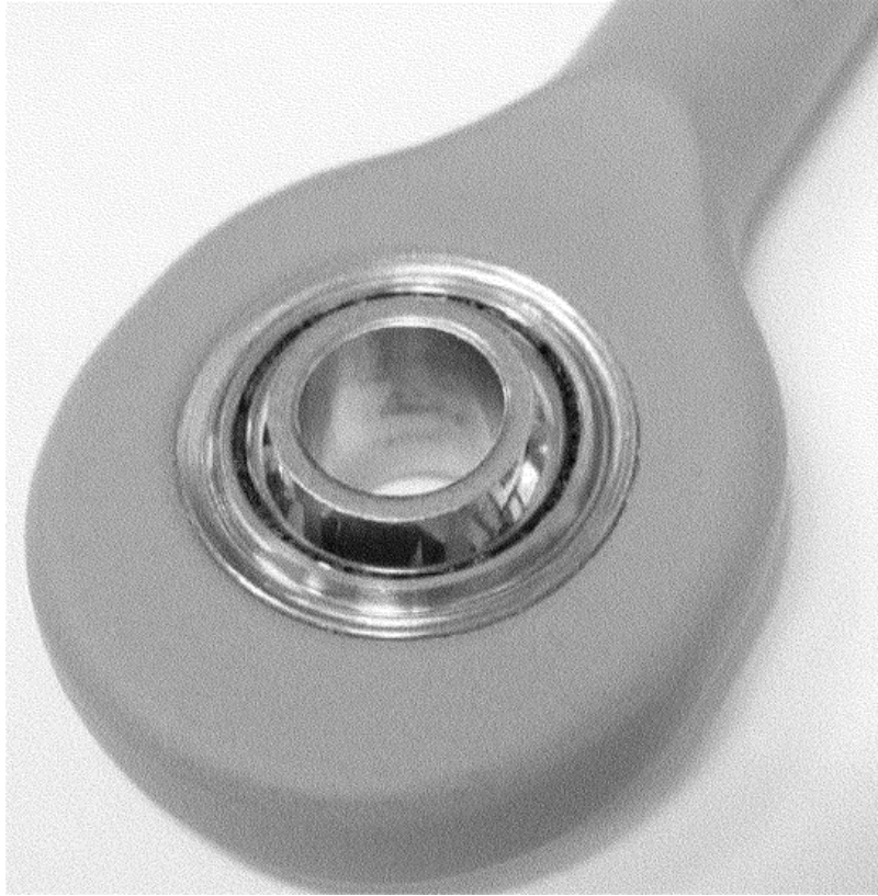
Figure 2 to Paragraph (e)

(5) If a bearing is not completely swaged or there is a gap between the edge of the bearing and the chamfer, as shown in Figure 3 to Paragraph (e) of this AD, replace the pitch link with an airworthy pitch link.